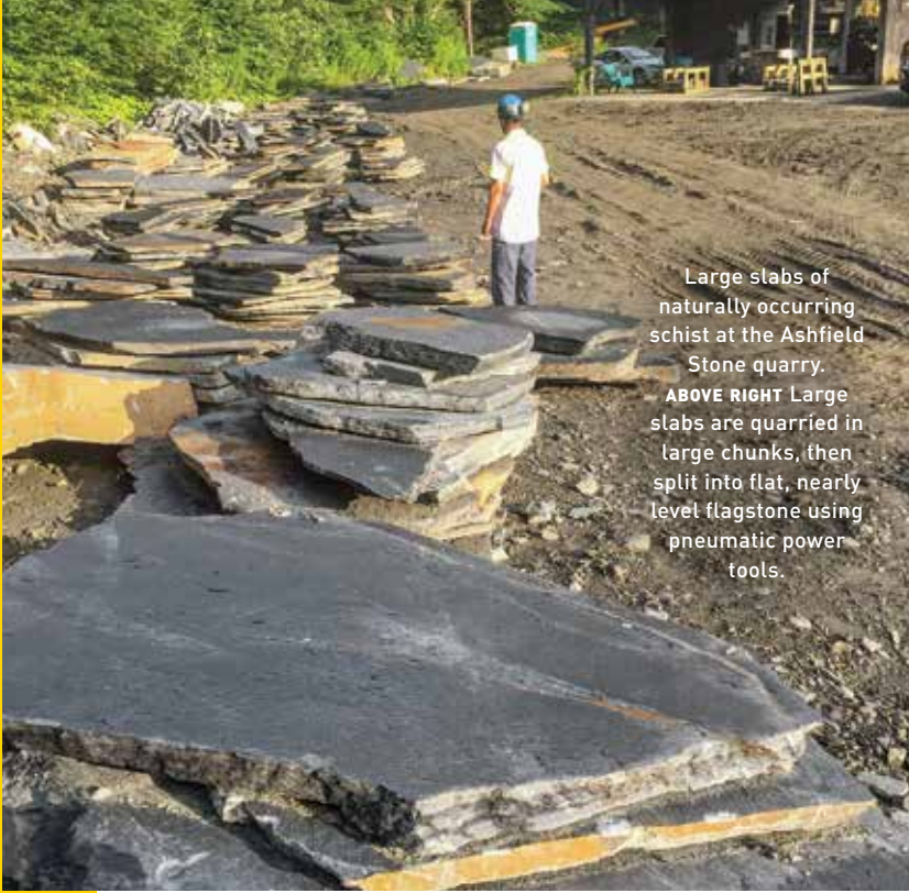
Large slabs of naturally occurring schist at the Ashfield Stone quarry.

ABOVE RIGHT Large slabs are quarried in large chunks, then split into flat, nearly level flagstone using pneumatic power tools.