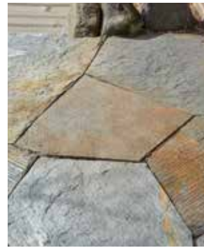
LEFT Good flagstone has a foliated texture, as seen in this installation. The bronze color comes from iron-saturated water seepage over millions of years.