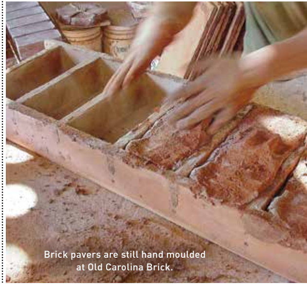
Brick pavers are still hand moulded at Old Carolina Brick.

Step 3 The stone splits in clean, level layers: perfect for landscape stone.