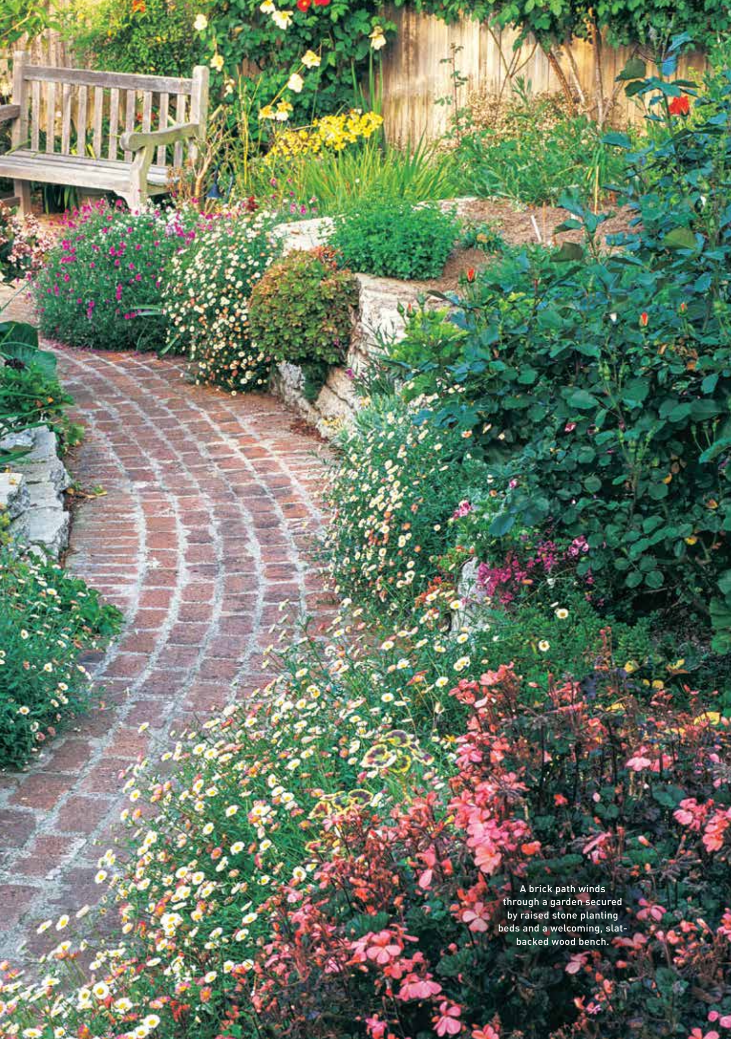
A brick path winds through a garden secured by raised stone planting beds and a welcoming, slat-backed wood bench.