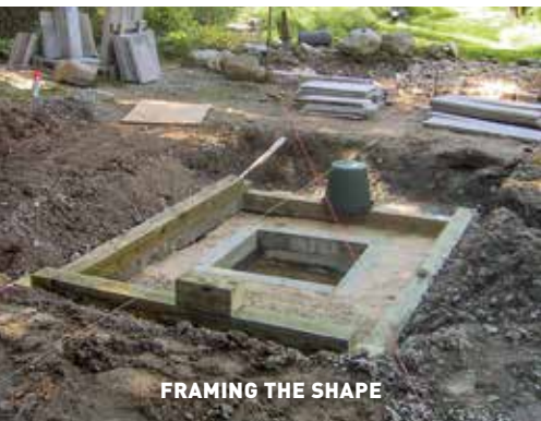
FRAMING THE SHAPE

Building the pond ■ FRAMING THE SHAPE The 6' x 9' rectangular pond is framed with a mix of found railroad ties, pressure-treated lumber, and cedar timbers. The designers included a deep well near the center for the koi, who like a deep place to get away from such predators as raccoons and herons. In the winter, frogs hibernate there. The depression also hides the underwater circulating pump. ■ LINING THE POND After filling the bottom with about 4" of sand, Bill and Jill put down a heavy felt liner, followed by a heavy rubber pond liner. The sand and felt protect the liner from punctures, prolonging its life. ■ TUCKING IN THE LINERS Both the felt and waterproof rubber liners were carefully laid in, then tucked and folded around corners and contours, like folding hospital corners on a bed. Bill and Jill allowed for overage so that the liners completely covered the framework, then trimmed off excess material. Bluestone coping was laid on top, anchoring everything in place. Filling the pond with water further flattened out the liner. ■ ADDING CLASSICAL ELEMENTS To complete the formal framework, Jill Chase and Bill Ticineto collaborated on the design for a grand pergola with an arched center and a second one on the other side of the pond. The arch shape also appears at one end of the pond.