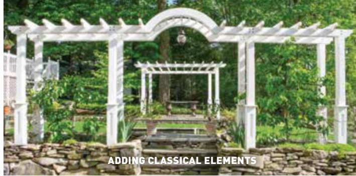
ADDING CLASSICAL ELEMENTS

Building the pond ■ FRAMING THE SHAPE The 6' x 9' rectangular pond is framed with a mix of found railroad ties, pressure-treated lumber, and cedar timbers. The designers included a deep well near the center for the koi, who like a deep place to get away from such predators as raccoons and herons. In the winter, frogs hibernate there. The depression also hides the underwater circulating pump. ■ LINING THE POND After filling the bottom with about 4" of sand, Bill and Jill put down a heavy felt liner, followed by a heavy rubber pond liner. The sand and felt protect the liner from punctures, prolonging its life. ■ TUCKING IN THE LINERS Both the felt and waterproof rubber liners were carefully laid in, then tucked and folded around corners and contours, like folding hospital corners on a bed. Bill and Jill allowed for overage so that the liners completely covered the framework, then trimmed off excess material. Bluestone coping was laid on top, anchoring everything in place. Filling the pond with water further flattened out the liner. ■ ADDING CLASSICAL ELEMENTS To complete the formal framework, Jill Chase and Bill Ticineto collaborated on the design for a grand pergola with an arched center and a second one on the other side of the pond. The arch shape also appears at one end of the pond.