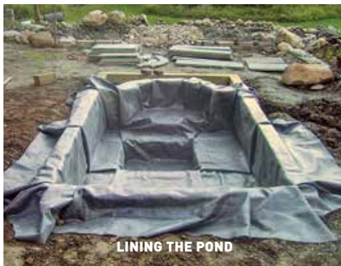
LINING THE POND